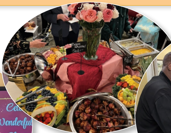
A robust spread of appetizers had something for everyone!