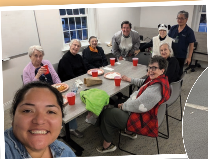
Our resident volunteers have some pizza following the festivities.